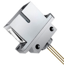
PD070-HL1-5xx SC Receptacle