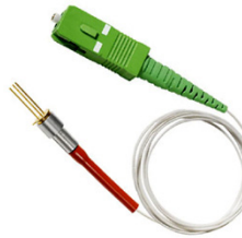
PD070-HL1-3xx SC/APC Pigtail