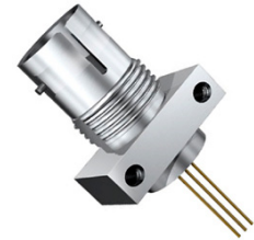
PD070-HL1-5xx ST Receptacle