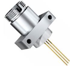
PD070-HL1-5xx FC Receptacle