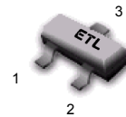
CASE 318-08, STYLE 11 SOT-23 (TO-236AB)

30 VOLTS DUAL HOT-CARRIER DETECTOR AND SWITCHING DIODES