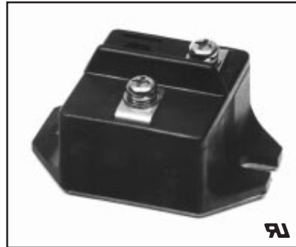
CS240610, CS241210 Fast Recovery Single Diode Modules 100 Amperes/600-1200 Volts