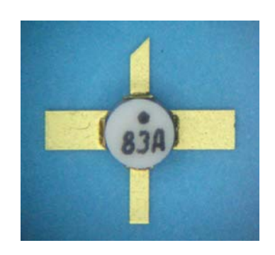
GATE LEAD IS ANGLED