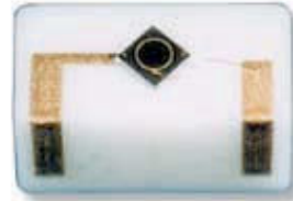
PD1M-0xx Ceramic Sub-Mount