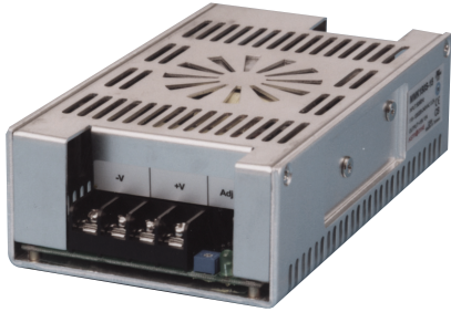
3"W x 5"L x 1.7"H