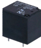
20.0×16.0×20.3 JZC-22F 3