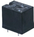
22.5×16.8×20.2 JZC-22F 2