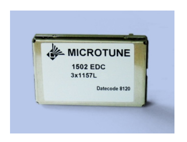
MT1502EDC DAB/DMB Tuner

The MT1502EDC is a high-end automotive tuner module with an integrated analog to digial converter for terrestrial digital audio (DAB) or video services (DMB).