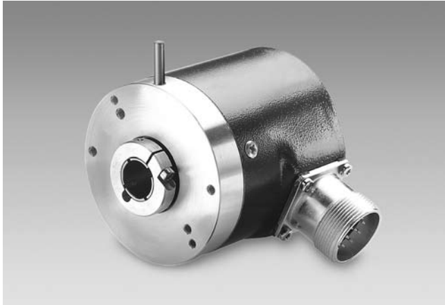
GXP5S with end shaft