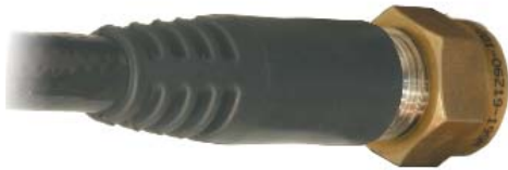
Series 802 Overmolded Cordset

Glenair's "Aqua Mouse" molded cordsets offer watertight sealing and excellent cold temperature flexibility. These cables are 100% tested and ready to use.