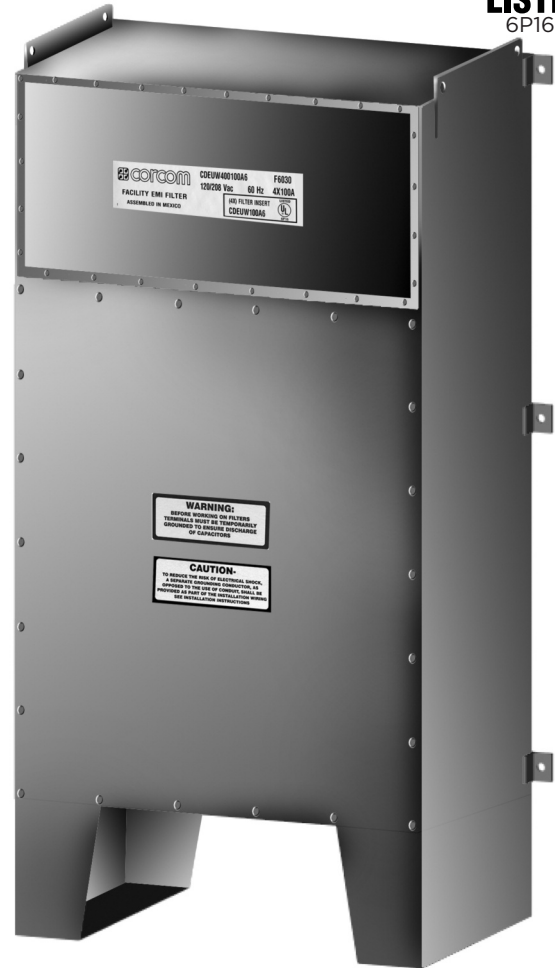
Shown with optional legs