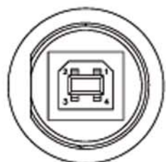
Pin Assignments Front View