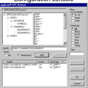
- OPC Browser