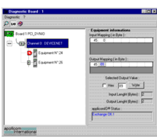
Diagnostic and test tools