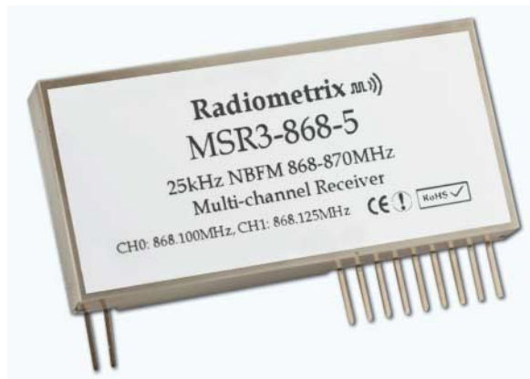
Figure 1: MSR3-868-5 receiver

The MSR3 is a 25kHz channel narrowband receiver intended for European 868MHz band Non-Specific SRD applications. The module offers a low power, reliable data link in an industry-standard pin out and footprint.