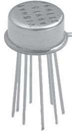
Product may not be to scale

The ten pin TO-5 package, with a 0.230" pin circle is the most accommodating of the TO-5 series of networks. It has the largest R capacity of the smaller TO series. This network can contain up to 12 V5X5 resistor chips.