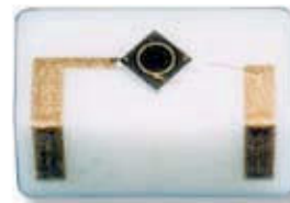
PD1M-0xx Ceramic Sub-Mount