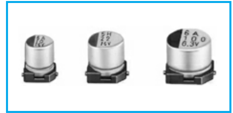
Marking color : Black print