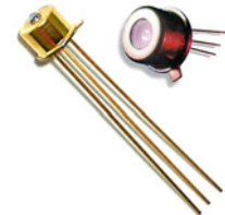
PD100-003-1xx TO can Package