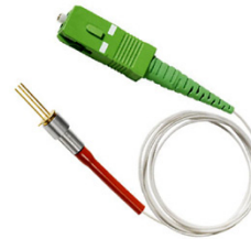
PD100-003-3xx SC/APC Pigtail