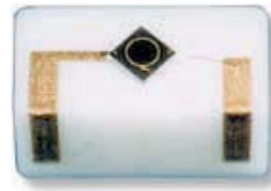
PD100-003-0xx Ceramic Sub-Mount