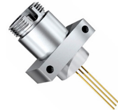
PD100-003-5xx FC Receptacle