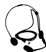
MC-73 AUDIO TECHNICA HEADSET MICROPHONE