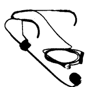
MC-51 CROWN HEADSET MICROPHONE