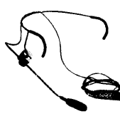
MC-52 CROWN HEADSET MICROPHONE