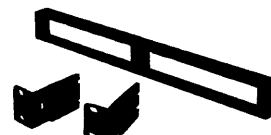
MP-50 FLEXIRACK™ 40" RACK MOUNT FRAME