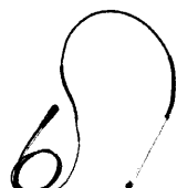
MC-53 AEROBICS MICROPHONE