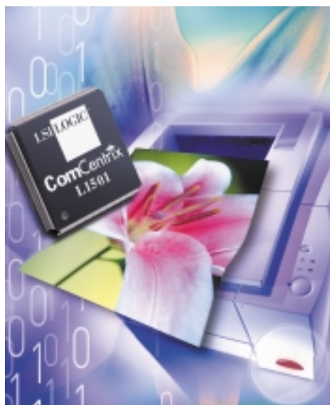
Standard product for peripheral I/O design

IEEE-1284 Parallel Port: IEEE 1284-1994 compliant bi-directional parallel peripheral interface with integrated DMA controller. Supports 1284-mode negotiations, device ID, compatibility (Centronics) mode, nibble mode, byte mode, EPP (enhanced parallel port) mode and ECP (extended capabilities port) mode.