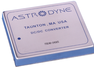
Unit measures 2.0"W x 2.0"L x 0.4"H