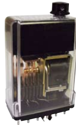
Industrial Pin Out