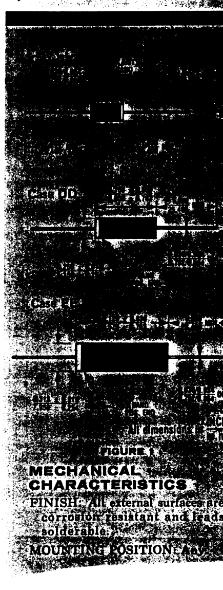
FIGURE 1 MECHANICAL CHARACTERISTICS FINISH: All external surfaces are corrosion resistant and leads solderable. MOUNTING POSITION: AA