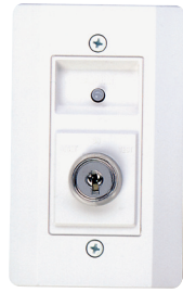
RTS451KEY UL S2522