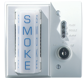
SSK451 with PS24LOW strobe and PS12/24 LENS lens