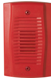
MHR UL S4011