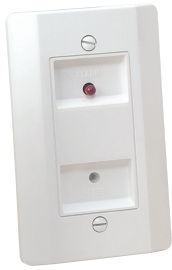
RTS451 UL S2522

System Sensor provides system flexibility with a variety of accessories, including two remote test stations and several different means of visible and audible system annunciation. As with our duct smoke detectors, all duct smoke detector accessories are UL listed.