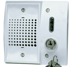
SSK451 UL S2522