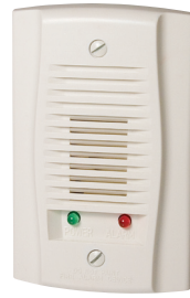
APA151 UL S4011