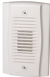
MHW UL S4011