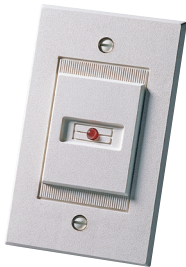
RA400Z UL S2522