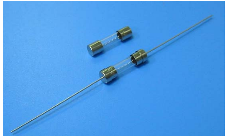
For Full Part number, please reference packaging and version specifications