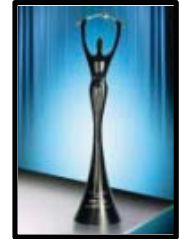
Electra Award 2005