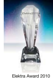
Elektra Award 2010