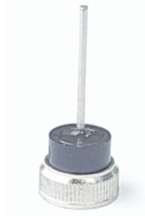
BOSCH TYPE PRESS-FIT