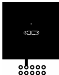
a) 80\text{ }^\circ\text{C/W} when mounted on a 1\text{ in}^2 pad of 2 oz copper