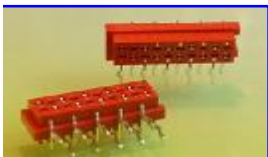
TMM-5 DIP Female R/A.