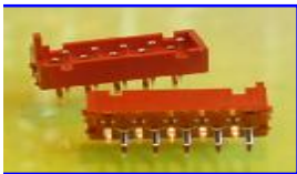
TMM-3 DIP Male.