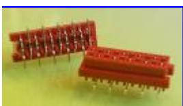
TMM-6 SMT Female straight.