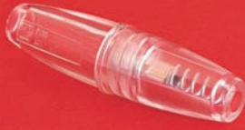
FX0180, FX0280, FX0380