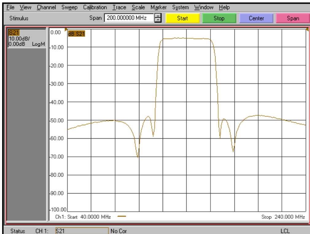
Overall Response (10 dB/div)

KR Electronics, Inc. 91 Avenel Street Avenel, NJ 07001