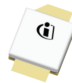
GTVA220701FA Package H-37265J-2