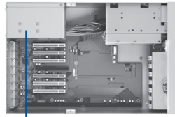
▲ Top view

Equipped with a power supply bracket securing the power supply better when the chassis is positioned in 90° orientation