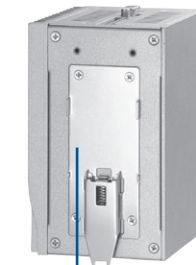
Din-rail kit ▲ Rear view