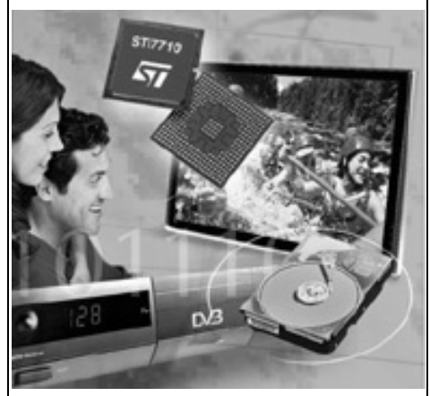
Figure 1. Package