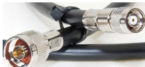
N-TRON ANT-CAB-400-N-RPTNC cable for use with the 702M12-W. N connector is pictured on left and RP-TNC connector on right