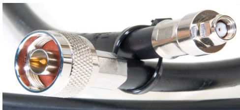
N-TRON ANT-CAB-400-N-RPSMA cable for use with 702-W. N connector is pictured on left and RP-SMA connector on right