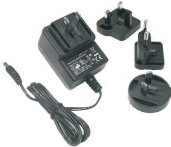
2.36" x 1.71" x 1.58"