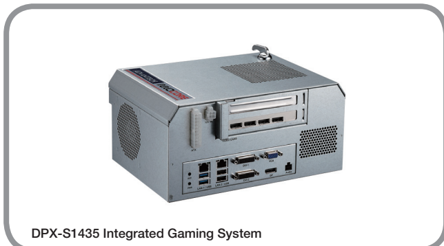
DPX-S1435 Integrated Gaming System