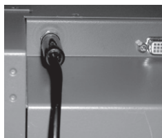
▲ Screw-type power input