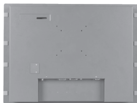
▲ Various mounting ways Panel/ Wall/ VESA