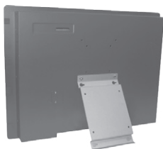
▲ Stand kit