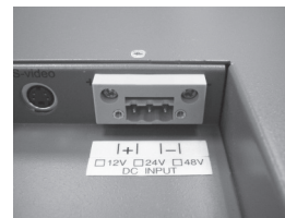
▲ Phoenix-type power input