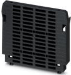
Panel mounting base, Color: black

Please be informed that the data shown in this PDF Document is generated from our Online Catalog. Please find the complete data in the user's documentation. Our General Terms of Use for Downloads are valid ( http://phoenixcontact.com/download )